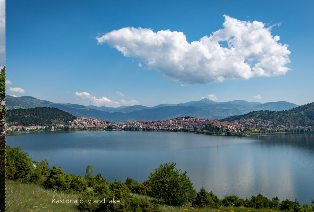
Kastoria city and lake