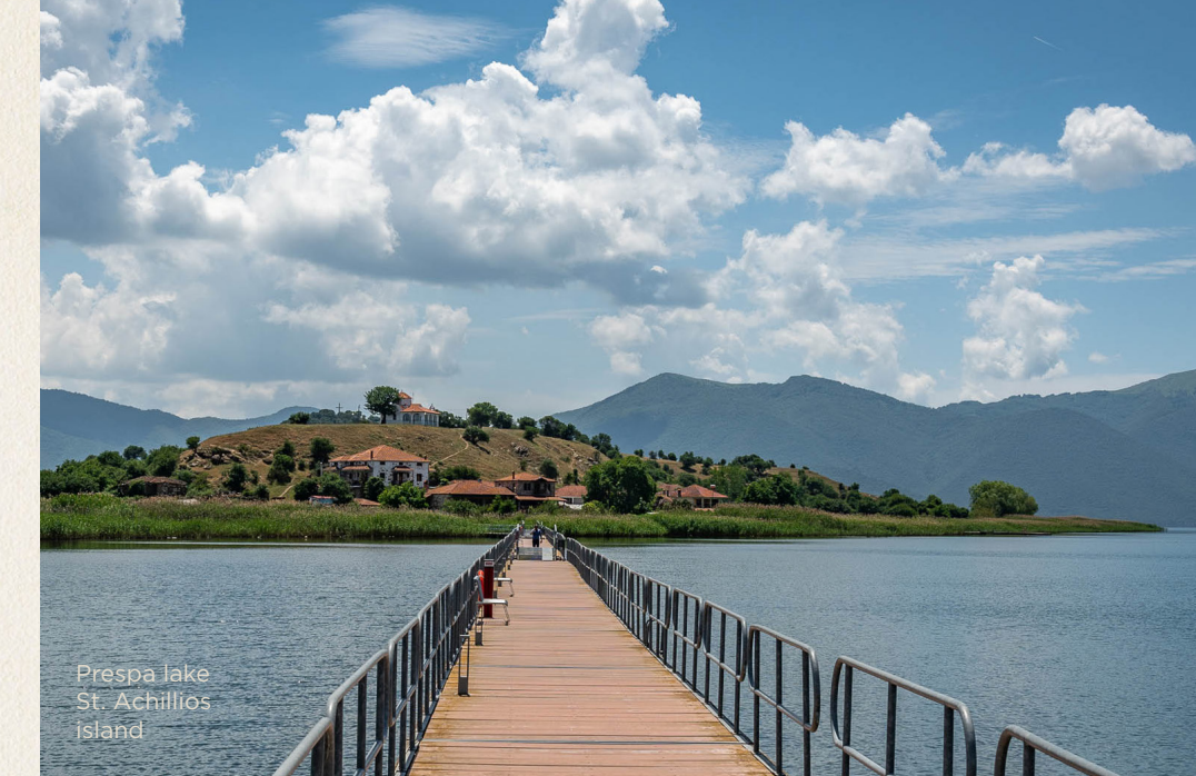
Prespa lake St. Achillios island